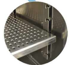
Removable / Adjustable Shelf